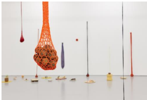
Veronica Ryan, Along a Spectrum , 2021

Ryan embeds precious bronze-cast seeds and fruits into disposable items, such as stacked mushroom trays and takeout containers.