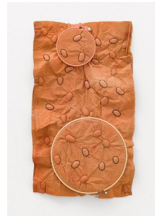
Veronica Ryan, Collective Moments III , 2000/2022

A number of monumental, framed lead pieces are encountered upon entering the Main Gallery. The multipart work entitled Cavities (1988) evolved out of one of Ryan’s earliest site-specific works Cavities in the Cloister Court . During a 1987-1988 residence at Jesus College in Cambridge, Ryan cut lead pieces into shapes that replicate the panes of the college chapel’s rose window, which is joined together by lead. She then placed these shapes into shallow holes she dug in the ground in the outdoor court to form a sunken imprint of the rose window. After the run of the installation, Ryan flattened and mounted them onto paper to create Cavities . The artist’s transformation of these fragments reflects the value she places on residues and remainders as well as her interest in transformation of objects into something altogether new.