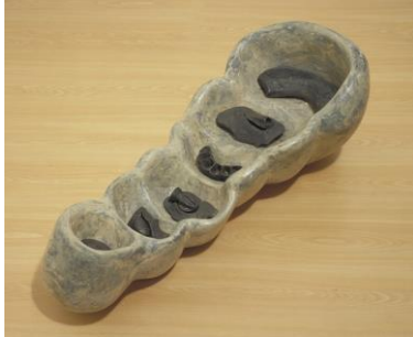
Veronica Ryan, Untitled , 1985

The last gallery returns to the motifs of fruits, seeds, and pods, exploring their many associations both personal and historical. A significant early floor sculpture shows the artist experimenting with the pod as a container as early as 1985. On loan from the Tate, the piece realistically depicts an empty pod, but one that is also clearly a container with compartments. Also here are two other floor sculptures: a monumental, green and spiky bronze Soursop (2021), depicting an uncannily oversize tropical fruit, and a pile of brightly colored ceramic cocoa pods at the center of a round jute mat, entitled Sweet Dreams are Made of These (2022). In these sculptures, seeds and fruit connote nurture and natural abundance. The gallery also sheds light on Ryan’s interest in the flip side of that abundance—waste and consumerism—with sculptures made from food packaging. In this grouping,