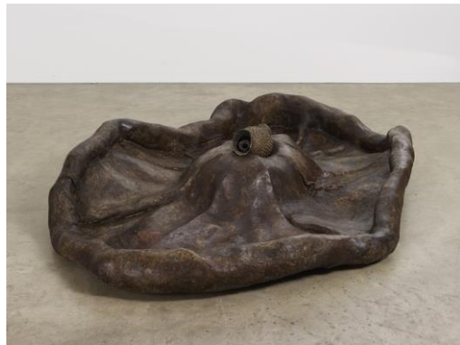
Veronica Ryan, Territorial , 1986

Among more than a hundred sculptures, textiles, and works on paper will be objects made of traditional art materials—i.e., bronze, marble, and plaster—as well as others sourced from such unexpected everyday items as seeds, pods, mango stones, orange peels, bandages, and plastic bottles. Ryan’s thoughtful reuse of organic materials in combination with mass-produced items suggests concerns around excess and consumption while also recognizing the unrealized potential of discarded objects.