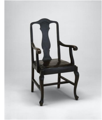
Scott Burton, Bronze Chair , 1972

For Burton, the placement of furniture could also encourage interpretations related to the choreography of everyday life. On the museum's main level a grouping of six chairs is installed to evoke his ideas of community (three steel chairs 1978-1985); intimacy (two curved steel chairs from 1989, installed face-to-face); and exclusion (a minimalist distillation of the wire bistro chair created in the late '80s).