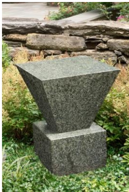
Scott Burton, Café Table , 1984-1985

In the Pulitzer’s small high-ceilinged Cube Gallery, four of Burton’s pedestal and table forms are juxtaposed with Constantin Brâncuși’s Mademoiselle Pogany III (1933) and Sleeping Muse (1926). Also here are installation shots of Artist’s Choice: Burton on Brâncuși (1989), the first exhibition in MoMA’s signature “Artist’s Choice” series, which generated controversy because Burton displayed some of the Romanian sculptor’s pedestals without sculptures, as objects in themselves worthy of appreciation.