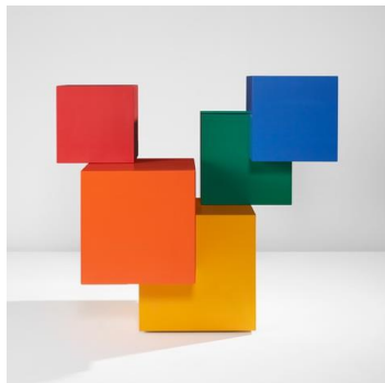
Scott Burton, Five-Part Storage Cubes , 1982

Scott Burton: Shape Shift transitions between private and public in a number of lesser-known works. The diminutive Child's Table and Chair (1978) could be an example of a Bauhaus playroom set, were its stretchers and splats not painted in red, blue, and yellow by the artist. In a nod to Minimalism and the absurd, Spattered Table (1974-1977) is a simple wooden table that Burton found, splattered with