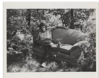
Scott Burton, Installation view of Furniture Landscape , July 31, 1970

The survey spans Burton’s career, featuring nearly 40 sculptures, more than 70 photographs, drawings, and ephemera, and the only known extant video of the artist’s performance work. Almost all of the archival photographs, diagrams, drawings, and ephemera are generously on loan from the Museum of Modern Art (MoMA) Archives, which maintains the Scott Burton Papers, its largest single-artist holding.