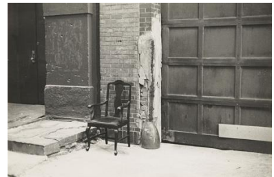
Scott Burton, Bronze Chair (Street Furniture) installed outside Artist's Space, Wooster Street, December 1975