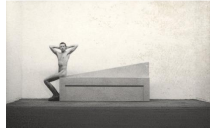
Scott Burton, Section III. Sexual Presentations [alternating aggressive and passive] , 1980

Scott Burton: Shape Shift features an array of little- or never-before-seen video, photographs, Polaroids, sketches, notes, and a poster related to Burton's proscenium performances. These include an oak table found and altered by Burton and repurposed as a performance prop; sketches that diagram movement, directions, and timing for performances; and Individual Behavior Tableaux (1980), the only known video of Burton's performance oeuvre, which documents the artist's last performance before he turned to furniture/object making full-time. Shot at the Berkeley Art Museum, the video is a glacially slow enactment of a variety of gestures, poses, and behaviors. The poses stem not only from Burton's study of nonverbal communication, but also allude to the bodily cues that signal sexual availability within gay cruising culture.