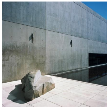
Scott Burton, Rock Settee , 1988-1990

Burton was a master of formal invention as well, as can be seen in a low horizontal sculpture entitled Two-Part Chaise Longue (1986-87). Here, four planes of pink Rosa Baveno granite are engineered into stable seating simply by being stacked into inverted V-shapes.