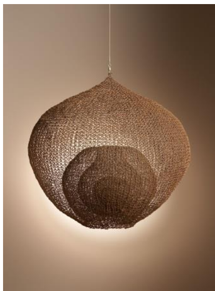
Untitled (S.095, Hanging Single-Lobed, Six-Layer Continuous Form within a Form), ca. 1952

Born in Southern California in 1926, Ruth Asawa was a first-generation Japanese-American, the child of truck farmers who, due to discriminatory laws, were not allowed to become U.S. citizens or to own land in California. As a child during the Great Depression, Asawa worked long hours on the family's farm, where she both learned the value of hands-on labor and witnessed the transformative powers of nature, which inspired much of her work. In 1942, following the attack by Japan on Pearl Harbor and the resulting Executive Order 9066, her father was sent to an internment camp. Later that year Asawa, her mother, and five of her six siblings were themselves detained in a series of camps.