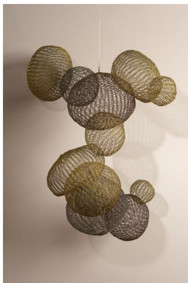
Untitled (S.089, Hanging Asymmetrical Twelve Interlocking Bubbles), ca. 1957

The exhibition opens with a display of single- and double-lobed looped-wire sculptures. These include Asawa's first documented fully-enclosed form, created in 1949 (this sculpture, like most of Asawa's work, is untitled). For this, she looped a single strand of wire into a teardrop shape, starting from the bottom and tapering the top into a long, narrow neck, at the uppermost end of which she repeated the teardrop form. Also present is a work that likely represents her first continuous "form within a form" sculpture, created by a process wherein, using a single strand of