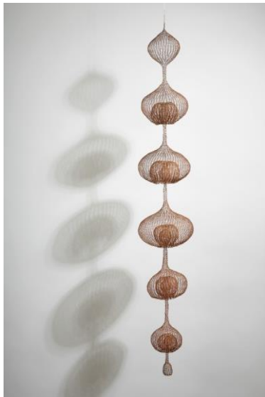
Untitled (S.077, Hanging Miniature Seven-Lobed Continuous Form within a Form) , ca. 1978

ST. LOUIS, MO, JUL 11, 2018 — The Pulitzer Arts Foundation presents Ruth Asawa: Life's Work , a career-spanning exhibition devoted to the important yet under-recognized artist. With some 60 sculptures and 20 drawings and collages, the exhibition will for the first time tell the story of how Asawa (1926-2013) developed her technique and form, tracing her artistic trajectory from her years studying at Black Mountain College until the end of her career.