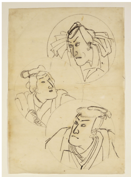
Utagawa Kuniyoshi, Three Kabuki Actors , ca. 1850

In nineteenth-century Japan, the primary role of what we call drawing—including many of the works on view in the exhibition—was as a means of creating the ukiyo-e woodblock prints that have come to be indelibly associated with Japanese art of the period. Commercially produced for mass appeal, these were popular among economically rising members of the lower classes, who decorated their homes with prints that most frequently depicted images of city life, including scenes, such as kabuki theater or brothels, that were drawn from the entertainment districts.