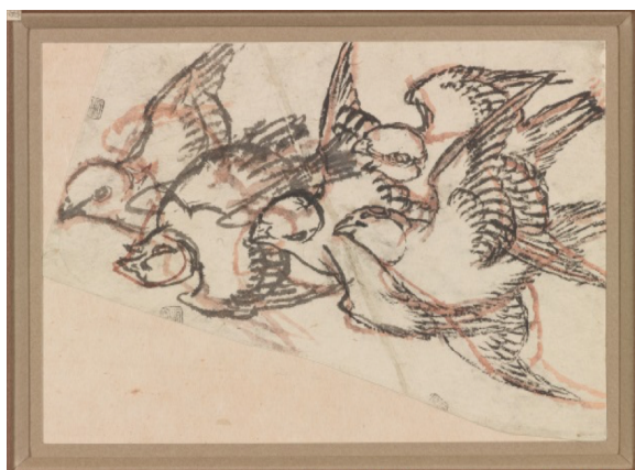
Katsushika Hokusai, Sparrows in Flight , 1830–40

This gallery also includes a selection of sketches by Katsushika Hokusai (1760–1849), perhaps the Japanese artist best known to Westerners, providing an introduction to the way he used drawing to continuously and rigorously develop his skill. An image of four sparrows in flight, for example, shows him working out the positions of their bodies with successive applications of grey, red, and black. Here, too, the red lines in the drawing give a sense of movement that would be lost in a print. Another example, this one depicting two oni —imp-like folkloric demons—is an image of playful contrast—one figure is coiled in apparent fear as the other springs to action—