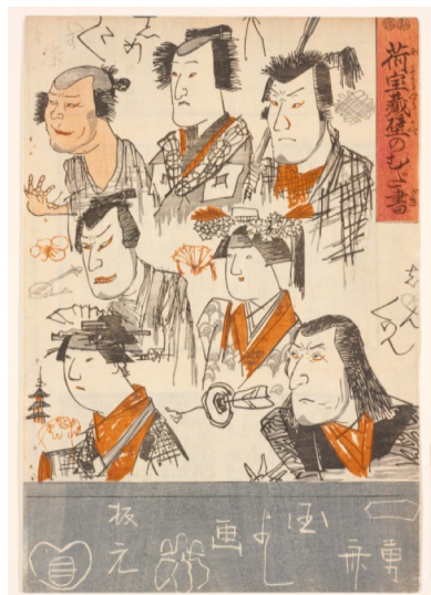
Utagawa Kuniyoshi, Scribbblings on the Storehouse Wall (Kitakaragura kabe no mudagaki), 1843-47

Kuniyoshi was adept at avoiding censorship and other restrictions as he continued to supply audiences with images of their favorite subjects. The woodblock print Scribbblings on the Storehouse Wall (1843-47), for example, presents caricatures of seven celebrated kabuki actors. The artist maintained, however, that he was not presenting new images, but merely copying graffiti that had been etched into the plaster of a storehouse wall. Although the figures here are