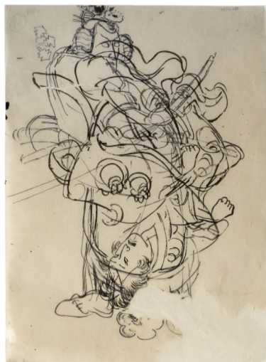
Utagawa Kuniyoshi, Study of Two Actors , 1830s–50s

Companion exhibition intersperses 20th–21st-century animated films among the 19th-century drawings