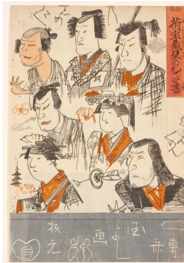
Utagawa Kuniyoshi, Scribblings on the Storehouse Wall (Kitakaragura kabe no mudagaki), 1843-47

Kuniyoshi was adept at avoiding censorship and other restrictions as he continued to supply audiences with images of their favorite subjects. The woodblock print Scribblings on the Storehouse Wall (1843-47), for example, presents caricatures of seven celebrated kabuki actors. The artist maintained, however, that he was not presenting new images, but merely copying graffiti that had been etched into the plaster of a storehouse wall. Although the figures here are