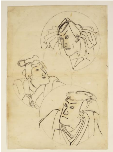
Utagawa Kuniyoshi, Three Kabuki Actors , ca. 1850

In nineteenth-century Japan, the primary role of what we call drawing—including many of the works on view in the exhibition—was as a means of creating the ukiyo-e woodblock prints that have come to be indelibly associated with Japanese art of the period. Commercially produced for mass appeal, these were popular among economically rising members of the lower classes, who decorated their homes with prints that most frequently depicted images of city life, including scenes, such as kabuki theater or brothels, that were drawn from the entertainment districts.