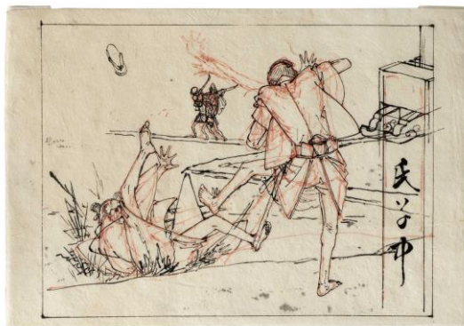
Tsukioka Yoshitoshi, Outdoor Fight Scene , 1870s-80s

Yoshitoshi left behind a good deal of work, including both preparatory sketches and freehand drawings, and these provided a rich trove of material for others to study. On one side of this gallery three groups of drawings will be installed above a drafting table with benches, paper, and