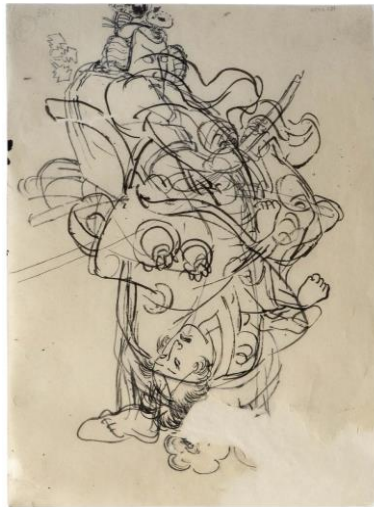
Utagawa Kuniyoshi, Study of Two Actors , 1830s–50s

Companion exhibition intersperses 20th–21st-century animated films among the 19th-century drawings