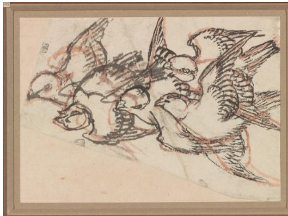
Katsushika Hokusai, Sparrows in Flight, 1830-40

demonstrating Hokusai's extraordinary creative abilities in the convincing depiction of even fictional creatures.